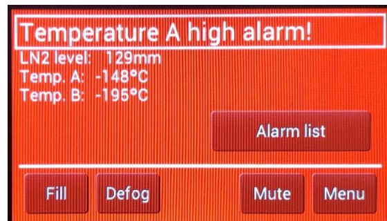
Alarm situation example

The CryoFill 2.0 can be used for controlling the liquid nitrogen level for any storage type, either conventional gas phase or the so called “dry” gas phase, with an absolute separation between the samples and liquid nitrogen, or full liquid phase. The CryoFill 2.0 can easily be retrofitted to existing cryogenic storage vessels of any brand or type.