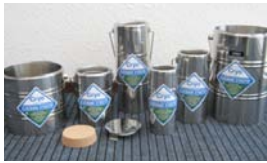
Standard D serie

There are several stainless steel open Dewar's available and if desired we can even supply client specific Dewar's. They can be used for storing liquid Nitrogen or dry ice (CO 2 ) pallets. The types can be divided in four groups the D series being the most common ones and the CS series the specials. We have divided the Dewar's based on the capacity / internal dimensions as these are the most important specifications when using open Dewar's